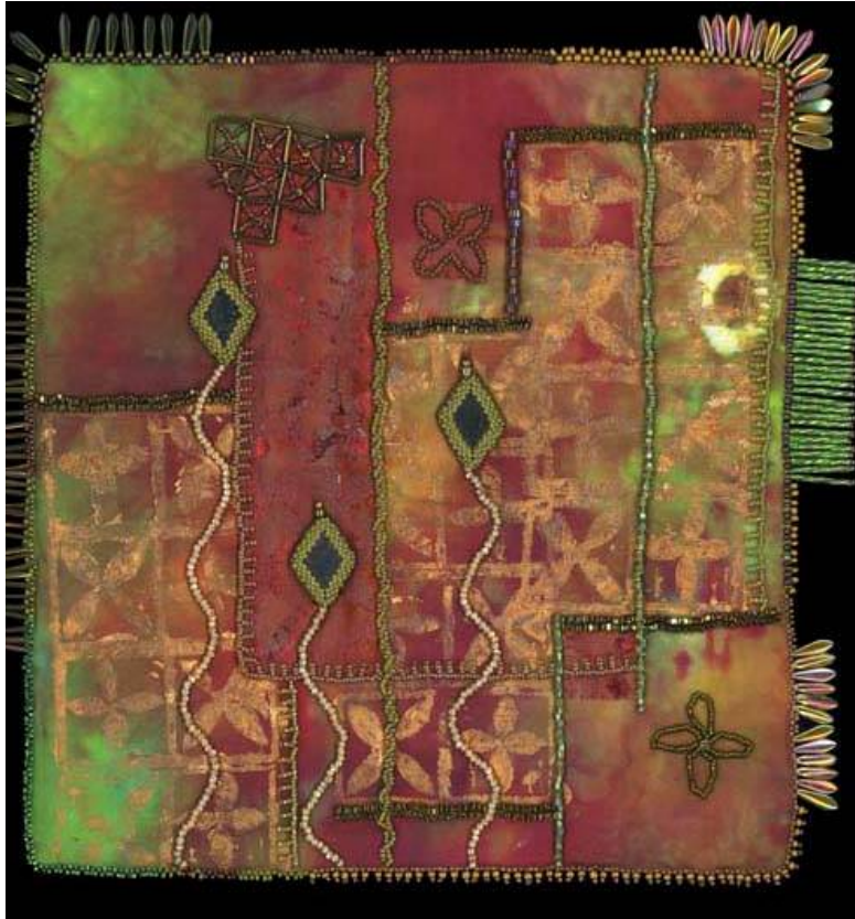
12" W x 12" L