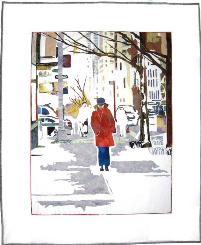
35" W x 40" L