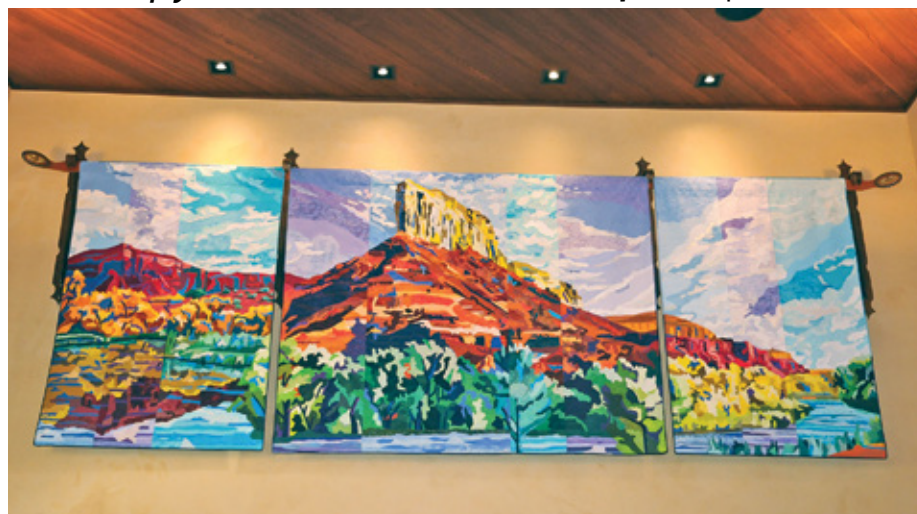
Palisade Triptych 72 x 186 inches ©2009 Katie Pasquini Masopust